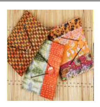
Few motifs and design of Nakshi Kantha