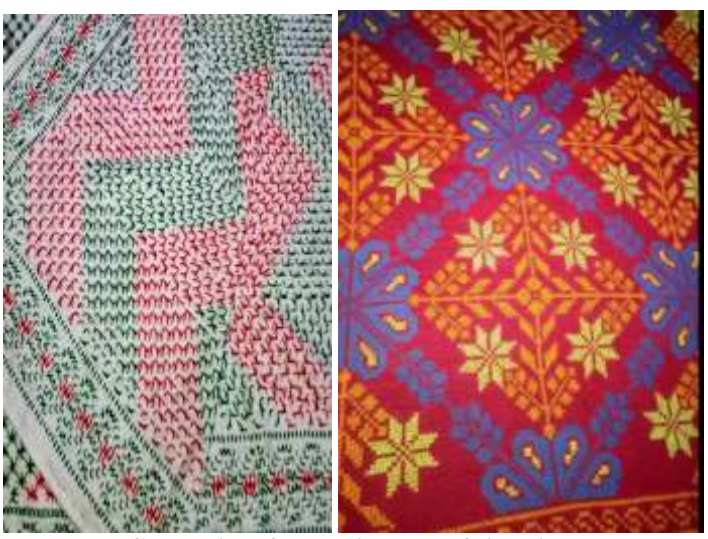
Categories of Nakshi kantha & its stitch